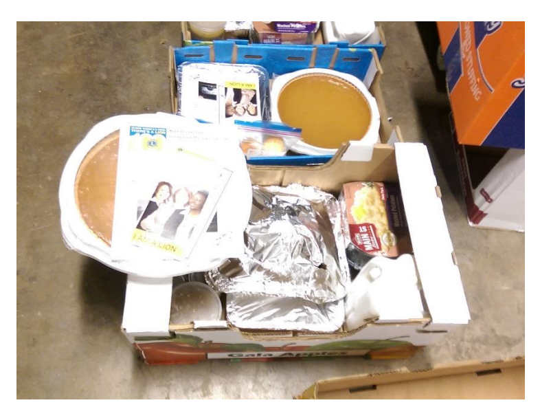
Page 29 of 31